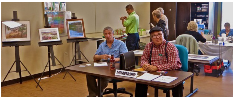
Volunteers: We Can't Do it Without You.